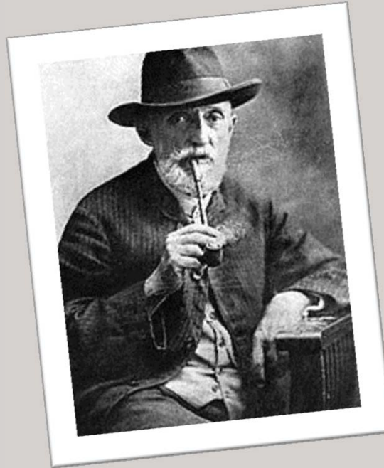
Francisco Oller y Cesteros