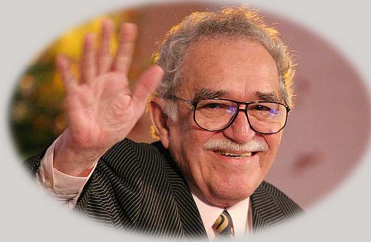
Gabriel García Márquez Lesson Plan: Literature